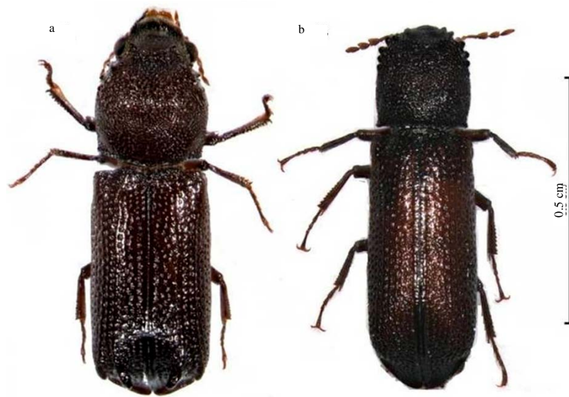
Fig. 1(a-b): (a) Male H. aequalis and (b) Female H. aequalis

Despite the status as important pest of timber and its products, the information regarding the distribution of this species globally is still scarce and not properly compiled. Therefore, this review was conducted to assemble the distribution check list of this pest and to map the distribution. Various journal articles, reports, online sources, monographs, records etc. globally as early as the year 1914 up to 2010 were reviewed. Several locality of the pest been recorded or intercepted were also included in the list. The presence and occurrence of Heterobostrychus aequalis species were assigned as native (N), present (P), intercepted (I), established (E), fail to established (F) and unknown (U).