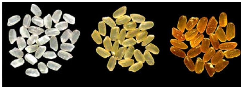
Fig. 1: Comparison of rice (left), Golden Rice 1 (middle) and Golden Rice 2 (right) (Paine et al. , 2005)

significantly in regions where rice is or could be a dietary staple for poor people through providing pro-vitamin A. (Paine et al. , 2005). The latter characteristic is the result of golden rice being genetically engineered to contain a higher level of beta-carotene in the endosperm of the grain (Ye et al. , 2000; Beyer et al. , 2002).