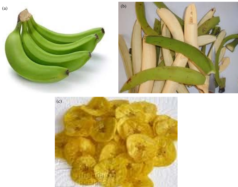
Fig. 1(a-c): Picture of unripe plantain ( Musa x paradisiaca ) (a) Unripe plantain fruits from Covenant University farm, (b) Peeled plantain and (c) Fried plantain chips

Statistical analysis: All the experimental results were the mean ( \pm standard deviation) of three parallel measurements. Data were evaluated by using Excel 97 as a tool for the analysis.