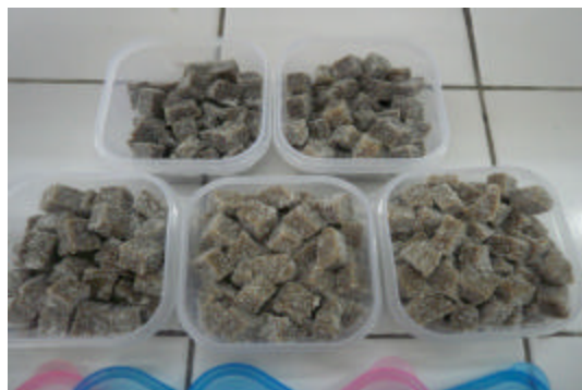
Fig. 1: Jelly Candy made from different addition of Soursop fruit extract

Characteristics of jelly candy: Table 2 showed that the texture, moisture content, ash content, reducing sugar, sucrose of different treatment were different significantly at \alpha = 5\% , but the aw of different treatment was not different significantly at \alpha = 5\% . The texture of the jelly candy was influenced by the addition of fruit extract. The higher of fruit extract added the higher of hardness. The range of texture was 0.76 until 1.33 mJ. This data shown