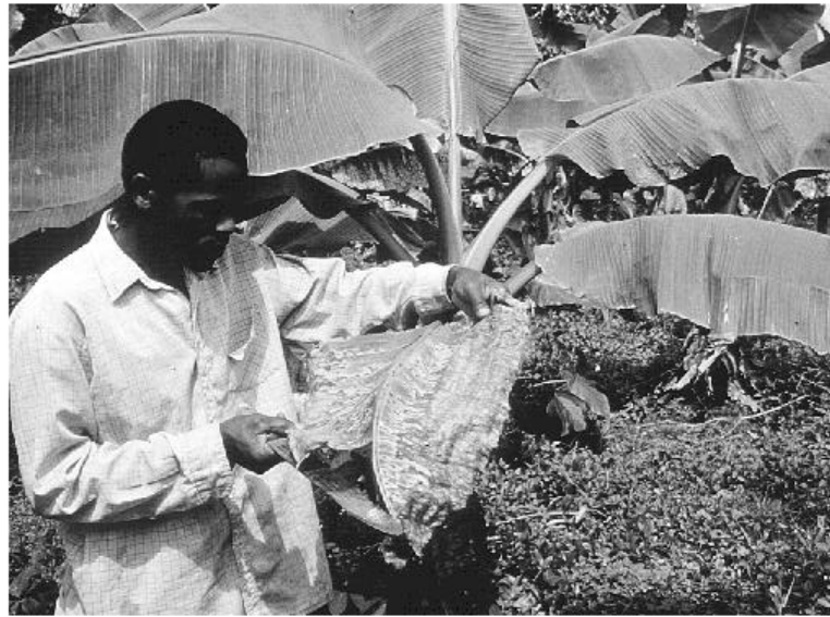
Fig. 1: Black sigatoka infested plant