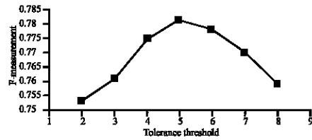
Fig.3: Sensitiveness to tolerance threshold

information systems. Web document clustering has become an important research area in web mining. Vector Space Model plays an important role in the researches covering a broad spectrum of topics. Though the model is constructed on a stable probability theory and simplifies computation, there are still some limitations in it.