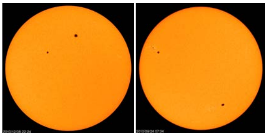
Fig. 1: SOHO/MDI continuum sample images