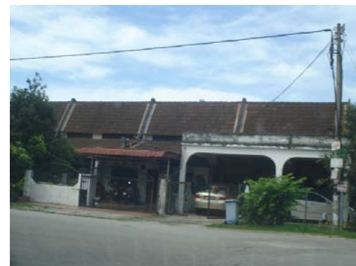
Fig. 3: The 1 storey terrace house in Bandar Baru Bangi, Selangor

them with a base that could legally hold an upward structure of the second floor unlike the conventional built of terraced house such as the case where the developer only build a 1 storey terraced house and it does not have a base to build the second storey.