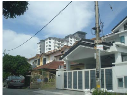
Fig. 1: The 2 storey terrace house in Bandar Baru Bangi, Selangor

Other than using the idea of a flexible floor plan, the home owner can also extend their home upwards and renovate the ground floor area according to their economic affordability. Basically, the idea is to provide