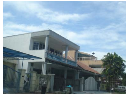
Fig. 2: The 1 storey terrace house that has been renovated into 2 storey in Bandar Baru Bangi, Selangor