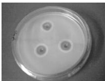
Fig. 1: Plate showing inhibition zone surrounded with stimulation zone of Staphylococcus aureus (NCIM 5021)