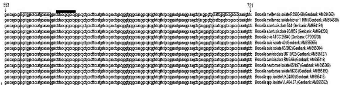
Fig. 1: Alignments of various gap gene sequences around of the gap 586/600 probes. The alignment contains 13 sequences taken directly from Genbank. In this figure, the variable region of Brucella sp. are bold and underlined and the black bar above figures represents the location of probe hybridization

Clinical samples: About 52 blood samples from cows in this study confirmed with B. abortus antibody positive by Rose Bengal Spot agglutination Test (RBT) were tested in this study. All cows were in the farms where brucellosis