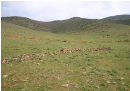
Fig. 2: The study area and experimental area in 2003

was determined by glass electrode on saturated soil samples. Electrical conductivity of the soil was measured in saturation paste extract (Rhoades, 1996). Lime content of the soil was measured by the Scheibler calcimeter. Organic matter content of the soil was determined by the modified Walkley-Black wet oxidation procedure described by Nelson and Sommers (1996). Nitrogen content of soil was determined by Kjeldahl method (Mckenzie and Wallace, 1954). The soil potassium content including exchangeable was determined using the methods described by Knudsen et al. (1982). The soil texture was determined by the hydrometer method (Bouyoucos, 1951). The phosphorus content of the samples was determined by spectrophotometer, Jenway 6100 using the sodium bicarbonate method (Olsen and Sommers, 1982). The study area was selected and treatments randomly assigned to 25 plots within each of 3 blocks. Each treatment plot was 4×10 m with a distance between plots of 1 m. Treatments were repeated on the same plots for 2 years (2002 and 2003).