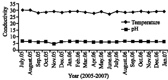
Fig. 1: Monthly average water temperatures and pH values during the study