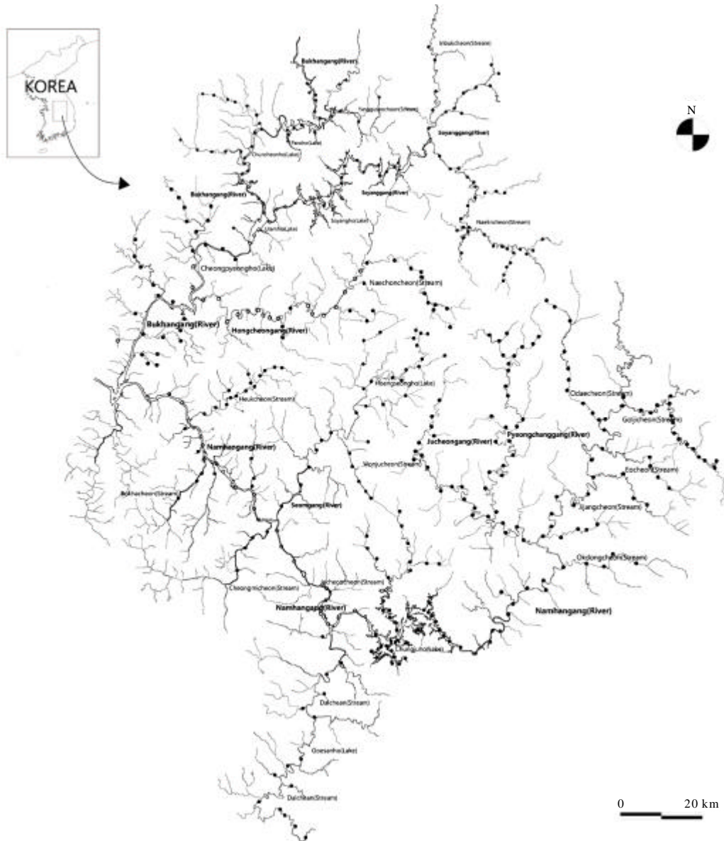
Fig. 1: Distribution of habitat points (•) of the Eurasian otter Lutra lutra in the Bukhangang and Namhangang regions of the Hangang river water system, South Korea

Researchers conducted field surveys from April 2009 to October 2011. Only spraints or footprints were accepted as evidence of Eurasian otter (Madsen and Prang, 2001). Field signs of the Eurasian otter were surveyed and collected by boat and on foot in the