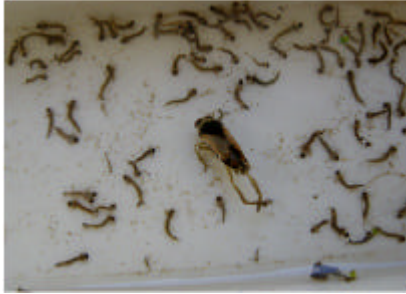
Fig. 1: Field experiments with Notonecta glauca