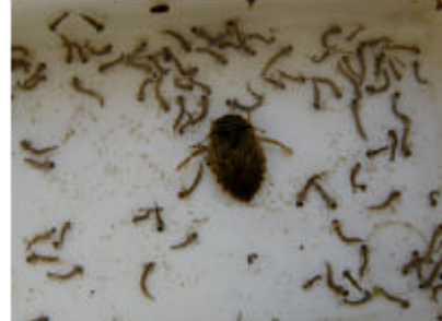
Fig. 2: Field experiments with Ilyocoris cimicoides

When analyzing the literature data, it became clear that the species of water bugs from the order Heteroptera inhabiting all types of water bodies are predators that feed on a variety of representatives of aquatic insects, including larvae, pupae and adults of families Culicidae and Simuliidae (Yesenbekova, 2006; Childibayev, 1980; Childibayev and Amanbayeva, 2014).