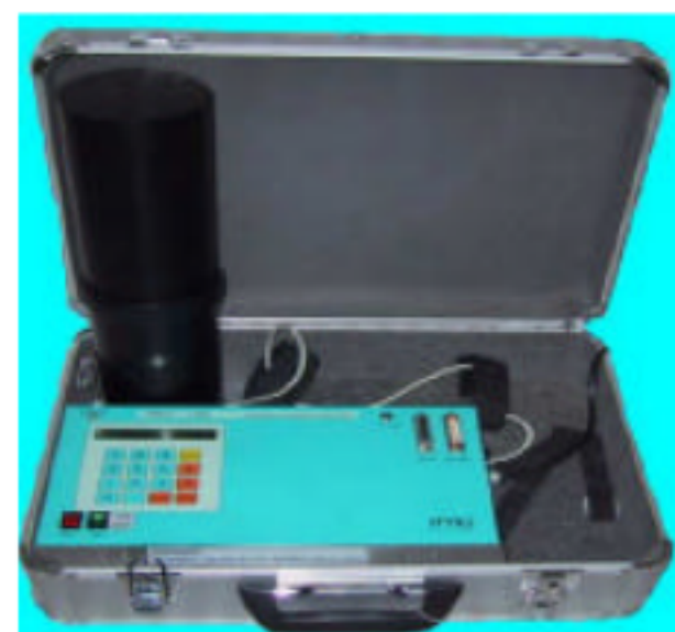
Fig. 2: Portable monitor AMES-PRM 145

Results are calculated using portable monitor of radon PRM-145 shown in Fig. 2. Radon concentration on air was measured with 0.7 dm 3 alpha scintillation cells (Vauputotie et al. , 1992) and calibration according to the