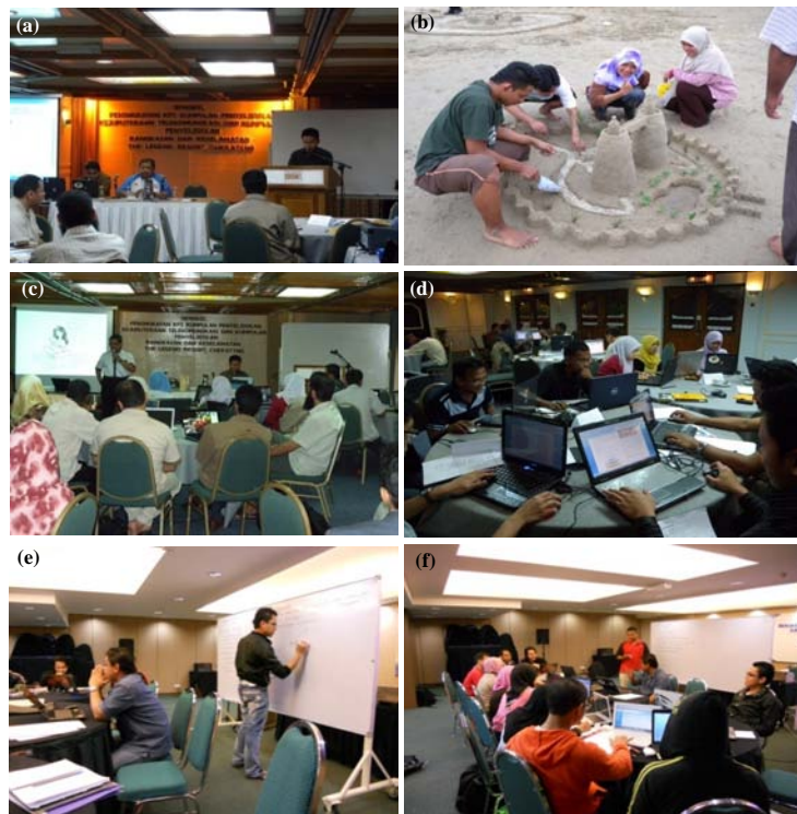
Fig. 1: Some of the activities can be organized in the publications stimulator workshop: a) the opening session; b) games; c) talk; d) writing session and improvement of the journal; d) meetings of research direction and e) presentation by the student

Figure 1 is an photography example of publications stimulator workshops were held by one of the research group in one of the local university.