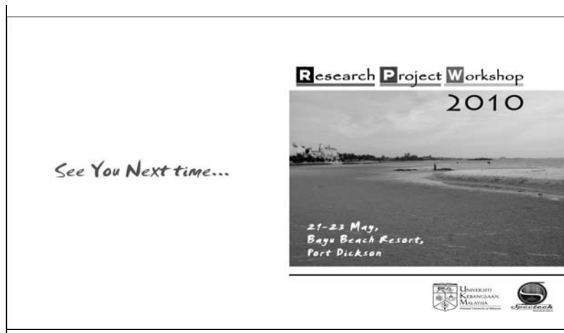
Fig. 2: Continue

Each student is instructed to prepare a manuscript relating to the latest achievements of their research. Organize a workshop at a less cost or within the budget. The manuscript prepared by each student completed and