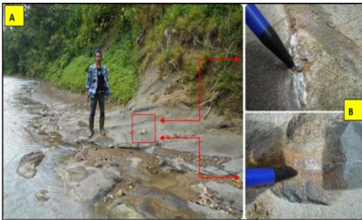
Fig. 3: a) The appearance of sub-propylitic alteration type outcrops on the location of the observation 13 (Coordinates: X: 279,666, Y: 9,180,616, elevation 148 m); b) the appearance of sulfide minerals pyrite in quartz veins (quartz veins) and wallrock which has been altered and shows the chlorite minerals. Direction of the image; outcrop N 290°E, parameter N 315°E

Megascopically on the field, the set of alteration minerals seen in outcrop location of this type of alteration in the research area is dominated by a set of minerals chlorite, kaolin, calcite, quartz and clay-sized minerals (clay) which can be seen and felt through its texture, color and streak. In addition, the presence of sulfide minerals are relatively occurring in this zone is in the form of pyrite (Fig. 3).