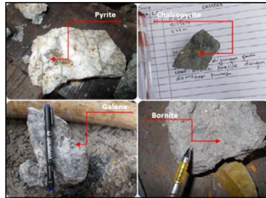
Fig. 4: The photograph of sample collection in the research area, Paningkaban village, Gumelar District, Banyumas Regency, Central Java

Mineralization in the research areas: Mineralization found in the research area is relatively associated to quartz veins (veins or veinlets) in the Halang sandstone unit as well as on the intrusion body in the study area. Ore mineralization contained in research area such as sulfide minerals such as: pyrite ( \text{FeS}_2 ), chalcocopyrite ( \text{CuFeS}_2 ), galena (Pbs) and bornite ( \text{Cu, FeS}_4 ) (Fig. 4).