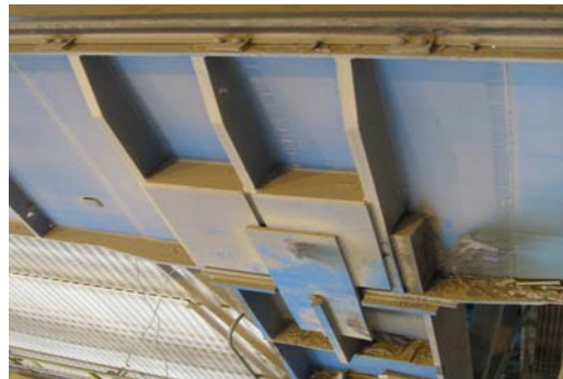
Fig. 3: The shift of CST support relative to the axis of the column

bridge cranes, the destruction of staircase and transitional site fastenings, the absence of welded seams on steel flooring fixture, the slots of maintenance area steel