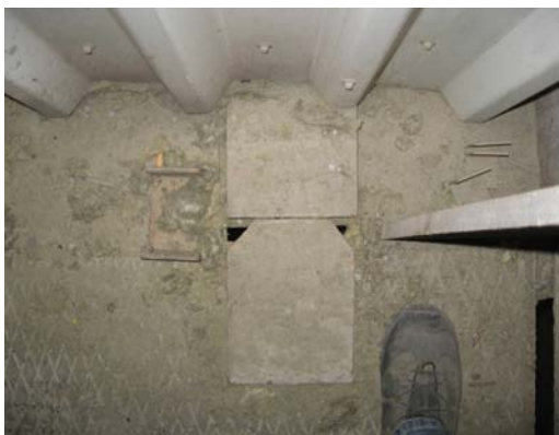
Fig. 6: The gap between the stops, the ends of the stops are not planed