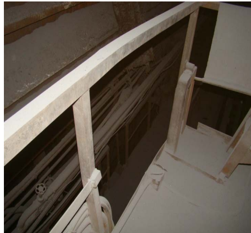
Fig. 9: The absence of the guard rail middle element

flooring, the absence of covers, caps and hatches. The most characteristic damages are shown on Fig. 9-12. The feasibility and reliability of scientific provisions and