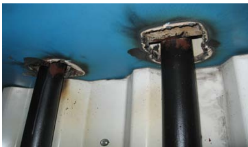
Fig. 12: Non-standard holes in the brake deck to pass engineering communications

application of the proven and recognized methods of data collection and statistical processing (Narkevich and Nischeta, 2012; Narkevich, 2012 )