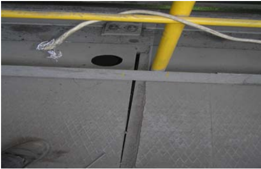
Fig. 10: The absence of a weld seam between the plates of the brake flooring