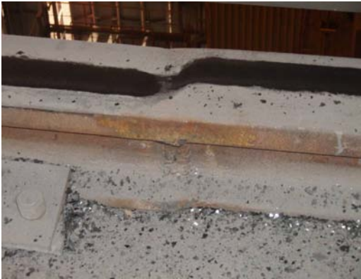
Fig. 5: Poor performance of the weld in the joint fastening of crane rails. The displacement of the rail edges by 10 mm