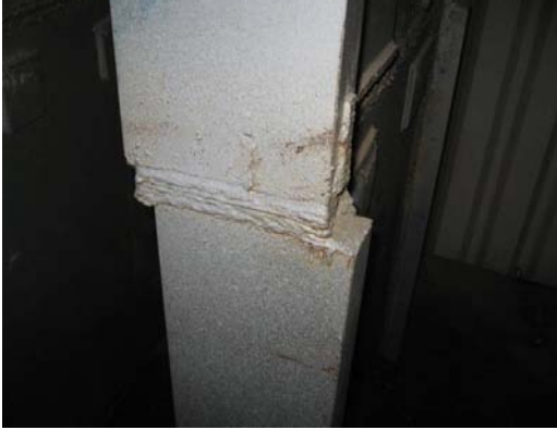
Fig. 4: The shift of CST pillar edges