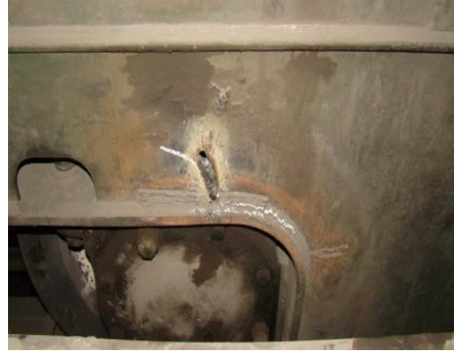
Fig. 1: The cracks in the welds of the end beam of a bridge crane with the load-carrying capacity of Q = 16+16 t

Minor defects and damages to structures and equipment that do not have a significant effect on safe operation: the absence or the deformation of railing elements on trolleys, end beams and the service areas of