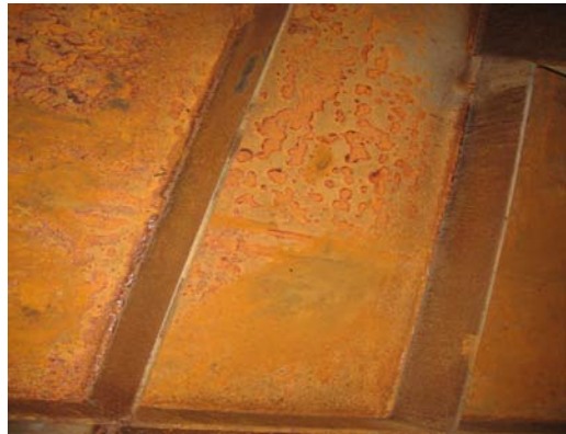
Fig. 8: The destruction of the paintwork and the surface corrosion of CST internal surface