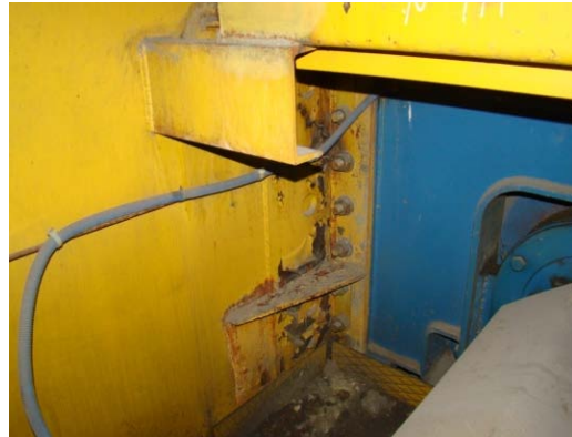
Fig. 2: Cracks in the joint node of the main and end beams of the bridge crane with the load capacity of Q = 50/10 tons