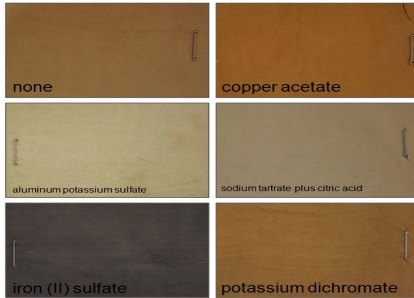
Fig. 2: Staining patterns of dye from the coat of onion and color changes by mordants