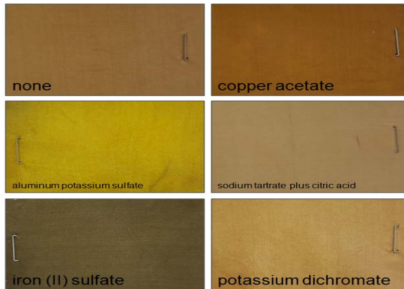
Fig. 3: Staining patterns of dye from the C. sinensis var. assamica -fermented leaf and color changes by mordants

Staining of fabric silk by the C. sinensis var. assamica -fermented leaf: Constituents of the C. sinensis var. assamica -fermented leaf are not similar with the coat of onion. Thus, mordants may be able to change the silk colors stained by the leaf as compared with the coat of onion. As shown in Fig. 3, original color without any mordant of “none” represented brownish. As the coat of the onion, although, there are darkness, copper acetate and potassium dichromate induced brownish as well and sodium tartrate plus citric acid did just like the mix of