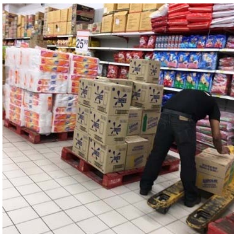
Fig. 1: Bending that involves awkward posture and awkward lifting