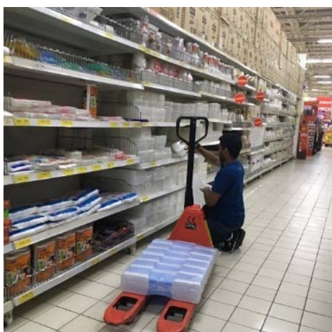
Fig. 2: Squatting and kneeling for a period of time, plus experience hand-arm vibration when pulling manual forklift

Workplace Ergonomic Risk Assessment (WERA): Workplace Ergonomic Risk Assessment (WERA) was developed to provide a method of screening the working task quickly for exposure to the physical risk factor associated with Work-related Musculoskeletal Disorder (WMSDs) (Rahman et al. , 2011). The WERA assessment consists six physical risk factors which were posture, repetition, forceful, vibration, contact stress and task duration.