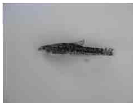
Fig. 4: Oxynemacheilus anatolica HUIC: AKD-13, holotype, 49.0 mm SL, input of karamanlı dam lake

Dorsal fin with 3 simple and 8 branched rays (rarely 5 and 7), anal fin with three simple and 5 branched rays, upper margin of dorsal and anal fins are straight to slightly convex. Distal margin of dorsal and anal fins convex, length and height of dorsal fin is almost equal. Pectoral fins with one simple, nine or ten branched rays (rarely 8), ventral fin with one simple and five branched rays. Pair fins relatively longer and pointed. Pectoral fin reached the anterior part of the dorsal fin base and ventral fin came up to anal opening. Predorsal distance is 2.0-2.2 (2.1) times in the standard length, predorsal and