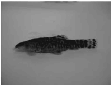
Fig. 1: Oxynemacheilus kaynaki HUIC: F-20, holotype, 60 mm SL, Goksu River, Nurhak, Elbistan