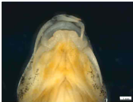
Fig. 5: Mouth shape of Oxynemacheilus anatolica