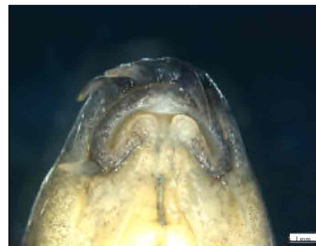
Fig. 2: Mouth shape of Oxynemacheilus kaynaki