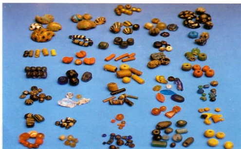
Fig. 3: Among the beads found in Bujang Valley, Kedah

crystals and agate beads. The rock crystals are quartz stone that is clear and colourless. These beads have a variety of sizes and shapes and the longest carnelian bead found is 5 cm long. The majority of these semi-precious stone beads came from India and was produced at Ratanpur near Cambay (Khambat), an export area of stone beads thousands of years old. In identifying the agate beads, we need to be careful because the beads look like agates but they are not actually agates; they are beads made of glass that resemble agate. These beads were found in Kota Tinggi and also Kuala Selinsing.