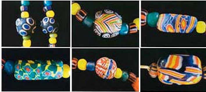
Fig. 2: Several type of polychrome glass beads found in Takuapa which similar with Sungai Mas polychrome glass beads