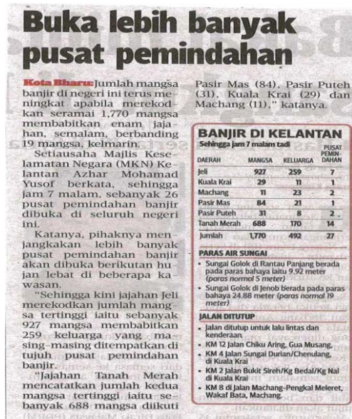
Fig. 1: Newspaper clipping on the related disaster

The 24 students of 21 female and the rest were male students were selected to be the research participants. These students were postgraduate students who enrolled in master in mathematics education. A video from YouTube at https://www.youtube.com/watch?v=IzavGW3vEwU which is on disaster was chosen to be the stimulus for this activity. The disaster is a massive flood tragedy which happened in East Coast of Malaysia in December 2014. One newspaper clipping as shown in Fig. 1 was used to describe the related event as additional stimulus.