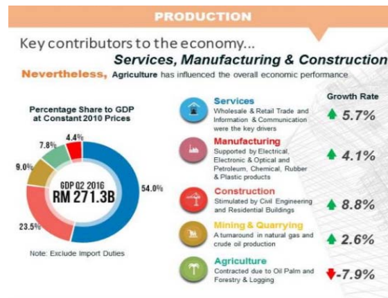
Fig. 1: The contribution of every industries towards Malaysia's GDP in second quarter 2016 (DSM, 2016)

According to the Department of Statistics Malaysia as shown in Table 1 the manufacturing sector became the second highest employment sector in Malaysia in 2014 (Anonymous, 2015a, b). Export of Malaysian manufactured goods is among the main sources of revenue. The exporting volume index of manufactured goods grew by 13.8% in June 2016 (Anonymous, 2016a-c). Malaysia has been ranked as the world's top manufacturing country by Cushman and Wakefield (Anonymous, 2014). To maintain