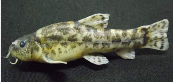
Fig. 3: General appearance of O. atili n sp.

Diagnosis: Oxynoemacheilus atili is distinguished from all other species of Oxynoemacheilus in Turkey by its colour pattern, shape of the bony capsule of the swim-bladder, scales present only the posterior part of the body and embedded in the skin and some body ratios.