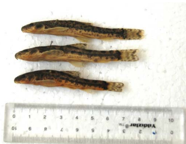
Fig. 1: General appearance of O. mesudae n sp.