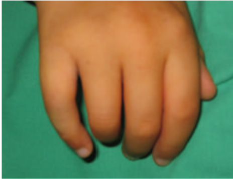
Fig. 1: Typical rotational deformity