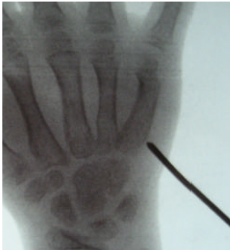
Fig. 2: A small window at the cortex is opened

usually fits very well for metacarpal bones and provides enough stability to maintain reduction. Only in younger patients a 1.5 mm ESIN can be useful.