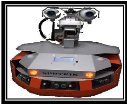
Fig.2: OkiKoSenPBX1 Robot with its 2CCD Cameras.

Software: The software is the robot oxygen as we human being relay on oxygen to respire hence life. This means that the software is the robot life, it is what the robot shown in Fig. 2 needs to accomplish its mission and here, we introduce a new strategy that generates an opportunistic and proper crafted trajectory that works as follows. We associate a route-planning generator module with a closed-loop locomotion control module.