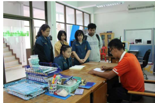
Fig. 12: Contact the Khok-Ko

Midstream phases: In analyzing the data, a survey of the community in the midstream, Thalad sub-district, Kaeng Loeng Jan sub-district, Muang district, Maha Sarakham province that live near the Kha-Kang creek. Based on interviews and questionnaires with residents of 100 people by convenience sampling. The results of the survey revealed that most respondents agreed with the development of Kha-Kang creek 89%, unsure 9% and disagreed 2%.