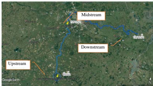
Fig. 1: Map showing the flow of Kha-Kang creek upstream, midstream and downstream

A feasibility study of the area and the situation of Kha-Kang creek can be described the results as follows. The upstream is covered the distance about 26.2 km. The retention of water in the upstream is about 126.4 million/N 3 . In the both riverside area of Kha-Kang creek is the main area for agricultural. And some of them is used for resting place for now a days. That there are a lot of people to take advantage on it. As a result, the water in the upstream of Kha-Kang creek is lower quality than