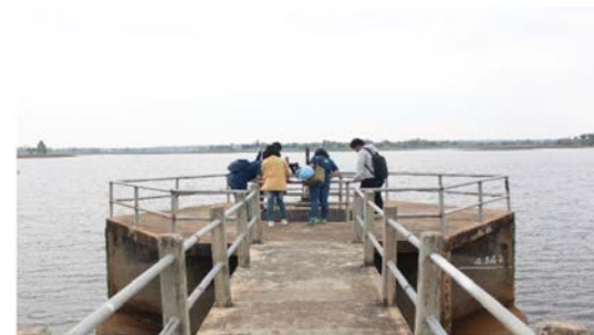
Fig. 4: Floodgate of Khok-Ko reservoir