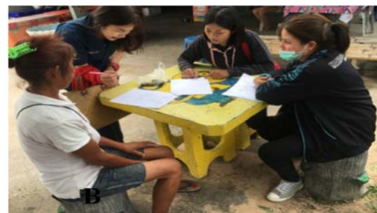
Fig. 13: To the questionnaire sub-district administration organization