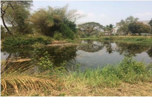
Fig. 6: Kha-Kang creek (Maha Sarakham University)