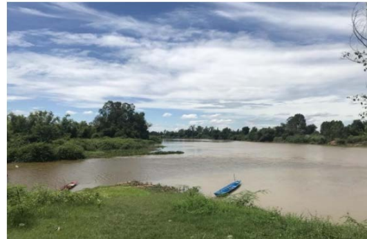
Fig. 10: Kha-Kang creek with Chi river, Tha Tum, Mueang, Maha Sarakham province