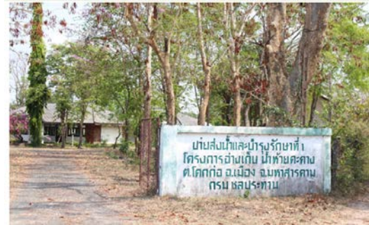
Fig. 11: Kha-Kang creek