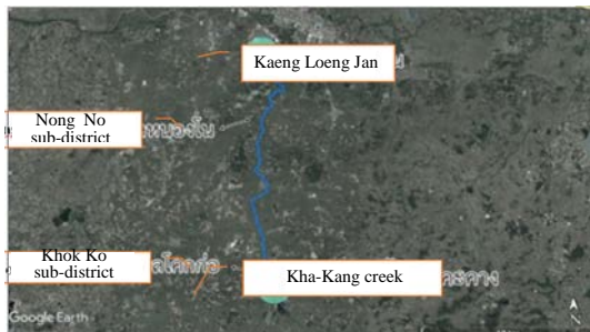
Fig. 2: Map showing the flow of Kha-Kang creek upstream

before. The canal has been shallow. That in the drought season the water in Kha-Kang creek is insufficient for the use of people in the area (Fig. 2).