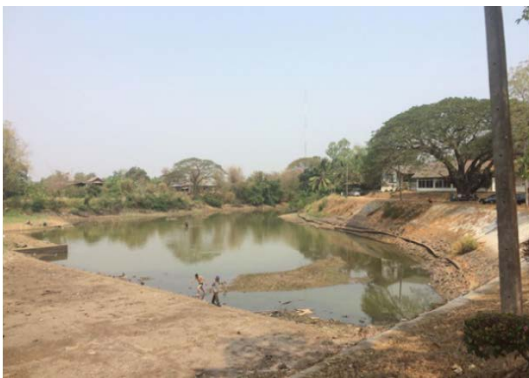
Fig. 7: Situation of Kha-Kang creek