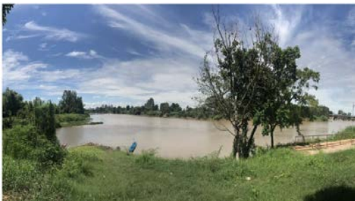
Fig. 9: Kha-Kang creek

sub-district and the distance along the canal is about 28.9 km. In the both riverside area is used for agriculture mainly. In their area has enough water in all seasons. The rainy season will be partially flooded. And some of water is released from consumption. That have an affect on the water quality in the canal lower (Fig. 6-8).