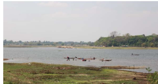
Fig. 3: Kha-Kang creek

A feasibility study of the area and the situation of Kha-Kang creek can be described the results as follows. In the downstream is covered the area from Mahasarakham University (Urban Campus) to Tha Tum