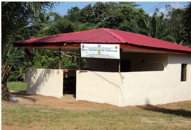
Fig. 2: The ICT resource center housing the accessories for the Animators' Club in Nigeria