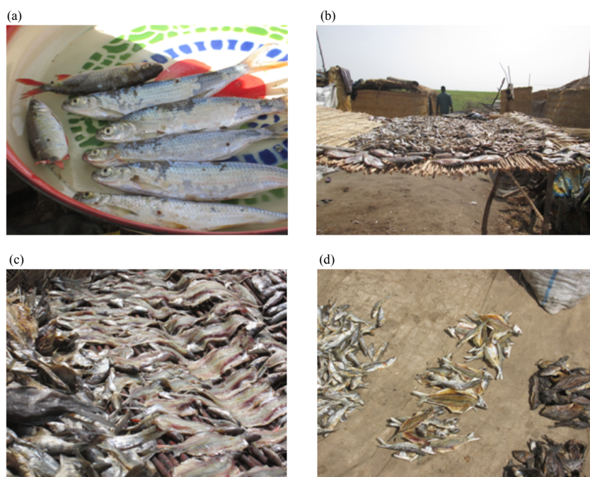
Fig. 2(a-d): (a) Hydrocynus forskalis specie use to produce Pelpeledgi, (b) drying some fishes without gutting Pelpeledgi, (c) drying Pelpeledgi on shed and (d) Pelpeledgi on market exhibited on simple bags

(Chad, Niger, Nigeria and Soudan). The largest importer of Pelpeledgi is Chad, followed by Nigeria. It should be noted that these quantities do not take into account informal flows which account for the majority of exports from neighboring countries. We were told that there's informal European destination also. Somme European population mainly originating from Northern Cameroon and Chad are also amongst consumer. Usually destinations registered for the European market are Italy, France and Belgium. This market, although full of many Africans and Asians is not a big demand for this product despite many initiatives of private exporters. The quality of the product constitutes a serious obstacle to its access to European market.