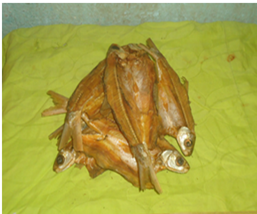
Fig. 1: Sun-dried fermented fish locally name Pelpeledgi

Social importance of Pelpeledgi: In total, 455 people were interviewed among consumers and processors. The actors in the sector of Pelpeledgi processing are numerous. Fishermen ensure the quest of the raw material by fishing and deliver it to the processors. The latter ensure all the operations of the processing (evisceration, trimming, fermentation, drying). Most of them are Cameroonian (90%), (80% women and 10% men) against 10% Foreign men from countries such as Mali, Tchad and Nigeria. The workforce is made up of man for fishing and women for processing. It is important to note that the few men involved in processing system are employees or direct family of women involve in transformation process. We also notice the presence of men involve in processing activities when it was a organize groups like cooperatives members and owners of the means of production. Among other things, this man ensures handling, supply, cutting, packaging, cleaning and disinfection of processing sites.