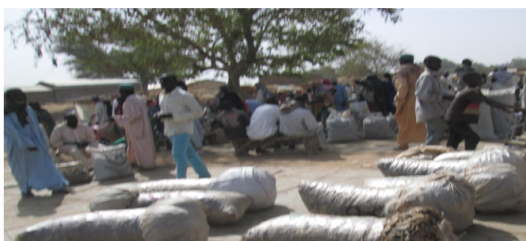
Fig. 4: Storage of Pelpeledgi into polyethylene plastic bags

Washing: The next step of the process is draining and evisceration of fish (Fig. 3). Once landed, the fish is grounded and transported in small vans or carts to the production site. The fish undergoes a preliminary trimming (peeling, evisceration, cutting ...) with a knife. The eviscerated fish is then rinsed once more with river water.