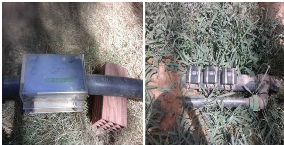
Fig. 5: Water magnetization device