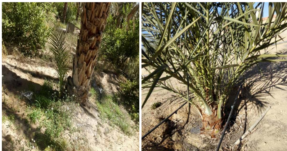
Fig. 7: Bubbler irrigation system in the oasis of Hazoua 5 (Tozeur)