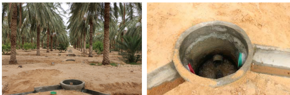
Fig. 3: Water distribution by buried pipeline