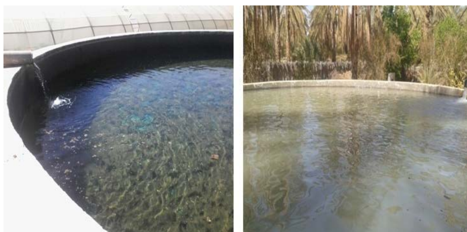
Fig. 6: Water storage basin

good results in terms of improving the quality of irrigation water. There are also good options to follow the recommendations by Wahba [13] to apply the cyclic use of fresh water with drainage water and to apply the deficit irrigation under water shortage condition to achieve the equity distribution of available water resources among different farmers. These options will help in utilizing all available water resources in a sustainable manner and maintain accepted crop yields under the conditions for arid and semi-arid during water shortage periods.