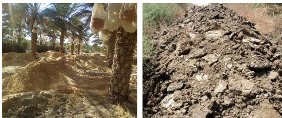
Fig. 8: Sand-manure amendment in oasis system of South Tunisia

confirmed that the bubbler irrigation system is the best system in reduction of water evaporation because the bubbler irrigation maintained the water directly in the root zone consequently the deep percolation reduced. Also according the study of Dhaouadi etc., the comparison between three irrigation techniques: mini diffuser, underground and bubbler, showed that the best performance was obtained during bubbler irrigation [19] .