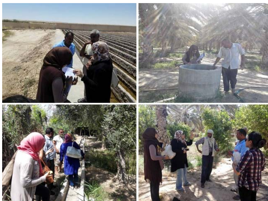
Fig. 2: Survey process