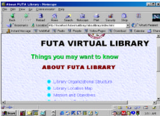
Fig. 2: About FUTA Library

Design overview: The Web site provides hyperlinks to the following information on the Home Page (Fig.1):