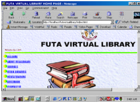
Fig.1: The Site's Home Page