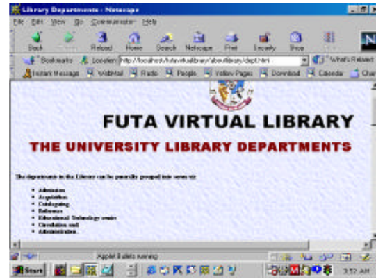
Fig. 3: The library's departments