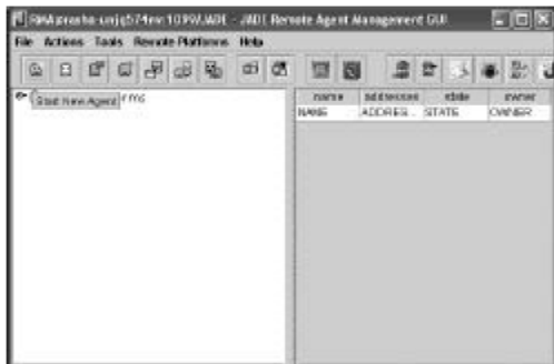
Fig. 2: Homepage of JADE GUI

The main aim of this research is to design and implement a novel routing scheme based on mobile agent technology in wireless Ad-Hoc networks that will provide the following benefits. Maximize network performance, scalability, provide end-to-end reliable communications and reduce possible delays and minimize losses that may incur due to bit-errors and handoffs. Another very important issue that