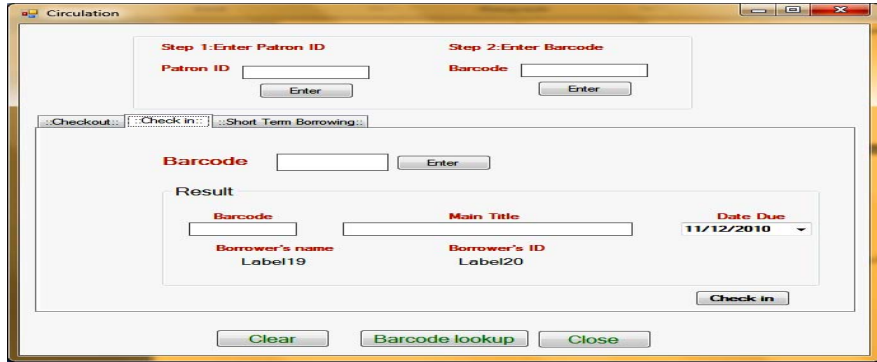
Fig. 6: Book checking in form