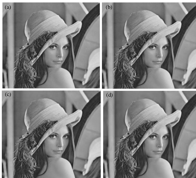
Fig. 4: SPIHT compressions of Lena image; a) input image; b) SPIHT(8:1); c) SPIHT(16:1) and d) SPIHT(32:1)

Two quantitative measures giving equivalent information are commonly used as a performance indicator for the compression. The compression ratio CR which means that the compressed image is stored using only CR of the initial storage size. The Bit-Per-Pixel ratio (BPP) which gives the number of bits required to store one pixel of the image. Two measures are commonly used to evaluate the perceptual quality. The Mean Square Error (MSE). It represents the mean squared error between the compressed and the original image. The lower the value of MSE, the lower the error. The Peak Signal to Noise Ratio (PSNR), represents a measure of the peak error and is expressed in decibels. The higher the PSNR, the better the quality of the compressed or reconstructed image. There are several things worth noting about these compressed images. First, they were all produced from one containing the 1 bpp compression of the Lena image. By specifying a bit budget, a certain bpp value up to 1, the SPIHT decompression program will stop decoding the 1 bpp compressed once the bit budget is exhausted. This illustrates the embedded nature of SPIHT (Pennebaker and Mitchell, 1993; Wallace, 1992). The compression of lena image by SPIHT algorithm as shown in Fig. 4.