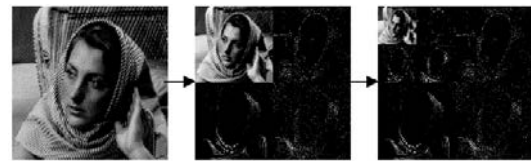
Fig. 3: Wavelet decomposition (I and II stage)

Compression algorithm (Deever and Hemami, 2003; De Vore et al. , 1992; Bajaj et al. , 2001) consists of a number of iterations through a dominant pass and a sub-ordinate pass, the threshold is updated (reduced by a factor of two) after each iteration. The dominant pass encodes the significance of the coefficients which have not yet been found significant in earlier iterations by scanning the trees and emitting one of the four symbols. The children of a coefficient are only scanned if the coefficient was found to be significant or if the coefficient was an isolated zero. The subordinate pass (Yoo et al. , 1999; Pennebaker and Mitchell, 1993; Wallace, 1992) emits 1 bit (the most significant bit of each coefficient not so far emitted) for each coefficient which has been found significant in the previous significance passes. The sub-ordinate pass is therefore similar to bit-plane coding. The wavelet decomposition of the grayscale image in two stages are shown in Fig. 3.