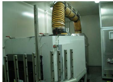
Fig. 3: Air wind-tunnel test

Researchers have done three groups of experiments totally. In the first group we input 80°C hot water and 20°C cold wind into the equipment. In the second group we input 71.1°C hot water and 48.5°C cold wind into the equipment and in the third group, we input 67.3°C hot water and 55.9°C cold wind into the equipment. Water flow is set to 0.4 kg sec -1 and ventilation flow is set to 29 m 3 /min. Then, we measure and record the hot water and air outlet temperature as shown in Table 2.