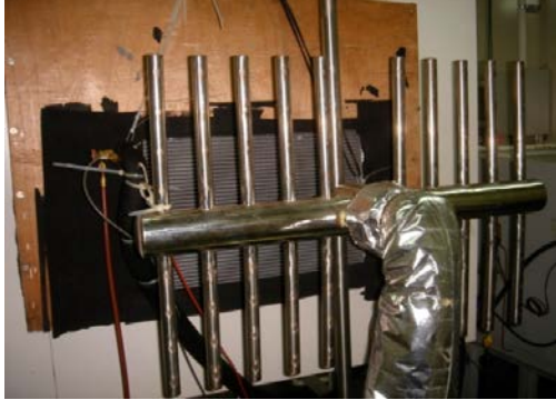
Fig. 4: Air data sample instrument