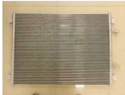
Fig. 1: Heat exchange bed

The heat transferring process in drying warehouse mainly takes place in the heat exchange bed. Hot water flows from the water inlet into the collecting tube and flat tube in the heat exchange bed. And exchanges heat with cold air through the fin of flat tube. After heat exchanging, the hot water flows out of the outlet. Heat exchange bed shown in Fig. 1. There are three pieces of heat exchange beds in the drying warehouse. They are connected to the heat exchange area by pipes. The heat transfer area is divided into six parts. From bottom to up are respectively, region I-VI as shown in Fig. 2.