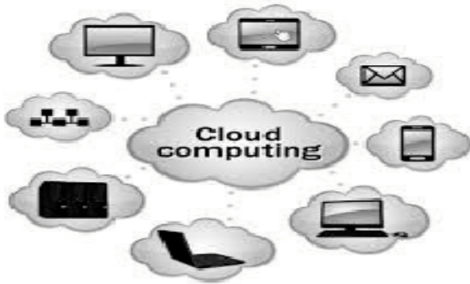
Fig. 1: The way users connect to the cloud ( https://community.emc.com/community/support/blog/2013/07/15/5-cloud-computing-trends-for-2013 )

computing technology and its impact in specific. Top level overview of the security taxonomy is proposed, highlighting the three main categories: security related to privacy, architecture and compliance (Fig. 2).