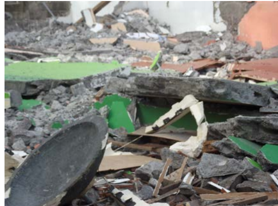
Fig. 4: Chunks of ruins

Communications network that installed in the robot for this study using a specific cable also must be able to send the data and information are good enough, so that the data and information provided by the robot can be accepted by the system.