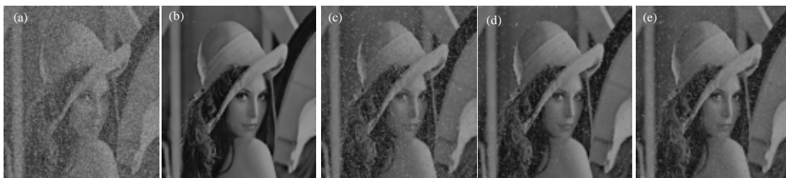
Fig. 1: Output images from different filters for the 50% corrupted Lena image: a) Noisy lena image; b) Proposed method (PA); c) ACWMF; d) PW-MAD and f) CEF

The restoration results for Lena test image corrupted with 50% Impulse noise are illustrated in Fig. 1. The proposed method output is compared with Adaptive Center Weighted Median filter (ACWMF), Pixel Wise MAD (PWMAD), Contrast Enhancement based Filter (CEF). It is clearly seen from qualitative results. That the proposed filter preserves edge sharpness and shows better performance in noise detection compared to other filters. The simulation results obtained are compared with the existing methods in terms of parameters such as PSNR and MAE values for test images Lena and flowers are analyzed in different noise density. PSNR and MAE values for different noise density input images are calculated in Table 1, 2 and Fig. 2, respectively. The PSNR value comparison between the proposed method and existing methods are deliberated. It is clear that the proposed method produces better denoised image with high PSNR while compare to other filters. PSNR value decreases for high noise density input images increases. High PSNR is obtained when the noise density is low. Even though, the proposed method produces better denoised image than other filters both in high and low noise density. It shows better tradeoff between impulse noise detection and image enhancement.