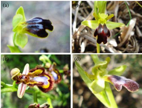
Fig. 3: a) Ophrys marmorata G. Foelsche and W. Foelsche, b) Ophrys fusca Link, c) Ophrys speculum Link, d) Ophrys mirabilis P. Geniez and F. Melki (K. Rebbas, 2008 to 2010)

predominance is sign of aridity of the medium. The codominance of the therophytes shows the importance of the anthropic action and the overgrazing in this zone.