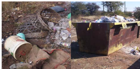
Fig. 2: Waste dumped on the backyard and an overflowing skip

Existing waste situation: This suburban area is mainly characterized by dense population which requires appropriate and safe Solid Waste Management (SWM) to create a healthy environment for the population. But the municipality in the area is hardly capable of providing adequate collection and disposal services, especially for the poor. Due to inadequate collection and disposal services, focus has shifted towards the Central Business Districts (CBDs) and the more affluent communities. The local residents were agitated by the irregular collection and disposal and failure to provide prompt collection services in their locality. This confirms the unfairness in the provision of waste disposal services in different residential communities. From Fig. 2, it is evident that the local authorities are not operating at full capacity in providing adequate collection services of solid waste in the area.