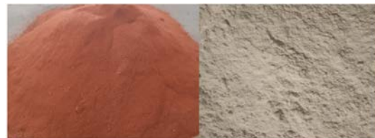
Fig. 1: Brick dust and limestone powder

Preparation and casting of test specimens: The experiments were conducted in the concrete laboratory, concrete mixes were made in a power-driven 50-L revolving type drum mixer. The coarse aggregate, fine aggregate, cement and combination brick dust and limestone powder filling materials ratios. The materials were mixed and distributions then water was added to the mix incrementally to attain the consistency required. After mixing, a portion of the fresh concrete was placed aside for fresh properties determination. Slump tests of fresh concrete were measured. The moulds used for the