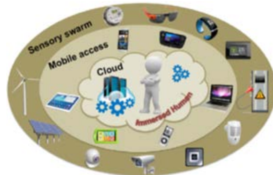
Fig. 1: Visual representation of internet connections (Acculation, 2015)

Fast forwarding to present time, personal computers are no longer the major shareholders in terms of internet