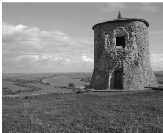
Fig. 7: Elabuga