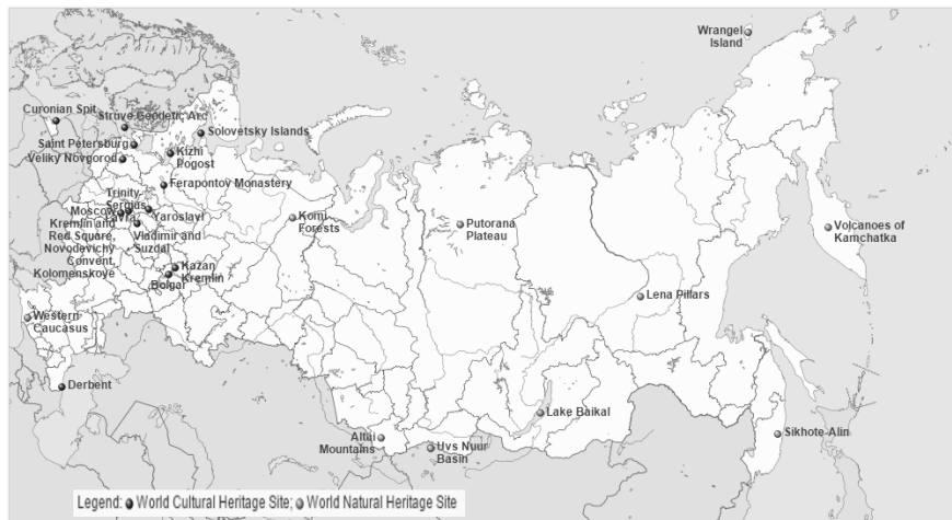
Fig. 3: UNESCO world heritage sites in Russia