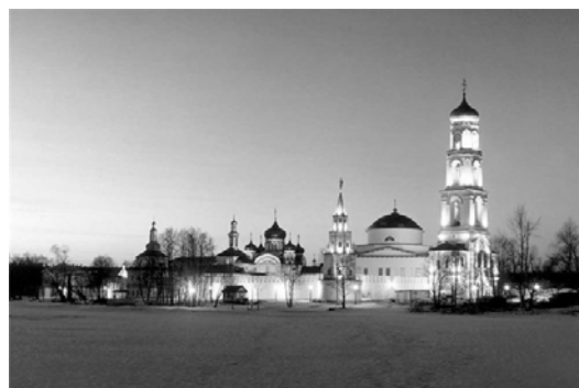
Fig. 9: Raifa Bogoroditsky Monastery

High level of preservation allowed to establish open-air museum in Bulgar that has a rich exposition. Bilyar Museum is a little less attractive for tourists because of low level of preservation of archeological and historical elements but it has great value as an object of