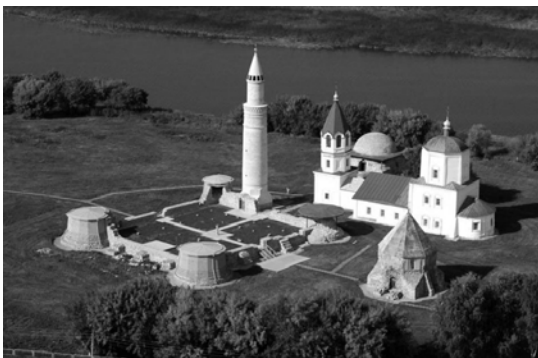
Fig. 5: Bolgar historical and archaeological complex

Theoretical overview on motivations for religious tourism: The necessity of recreation potential research is attributable to its significance in whole structure of recreation. It acts as a kind of foundation, on which different types of recreational activities form and come to life. Taking into account multifunctional structure of recreation including native, culture-historical and socio-economic components, the research must be comprehensive in nature. Most important in this research is revelation of the most attractive for the recreational purposes territories, on which organization of different kinds of leisure is possible and could take place the most complete realization of recreative demands. The designation of culture as a factor of great importance for urban development has become a very interesting scientific and research field, mostly in the last three decades, in the USA and Europe (Kong, 2000; Barnett, 2001). Creating a strong cultural industry which would include a variety of activities such as fashion and design, architecture, cultural heritage, local history, entertainment and generally the identity and image of the city in the external environment (Kong, 2000). In most cases, 'culture' has been widely used in various initiatives concerning the reconstruction/revitalisation of cities and especially their development through the use of specific