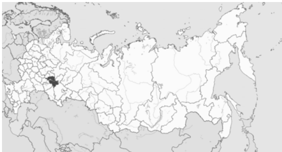
Fig. 1: The geographical position of the Republic of Tatarstan

Volga and the Kama. Kazan is located 797 km far from Moscow. Approximately four million people live in Tatarstan's 67836 km 2 area. The Republic of Tatarstan has a rich history, August 30, 2005 Kazan celebrated its 1000th anniversary. This point of intersection of cultures and religions: in Tatarstan is home to over 115 nationalities. Having united 159 countries, 27th World Summer