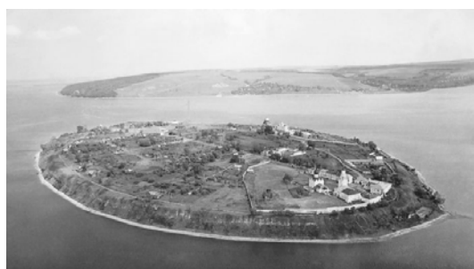
Fig. 8: Sviyajsk museums

High level of preservation allowed to establish open-air museum in Bulgar that has a rich exposition. Bilyar Museum is a little less attractive for tourists because of low level of preservation of archeological and historical elements but it has great value as an object of