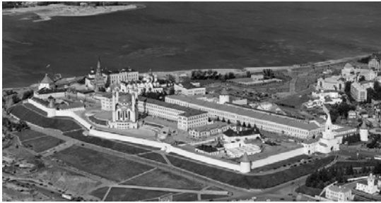
Fig. 4: Historic and architectural complex of the Kazan Kremlin