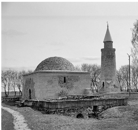
Fig. 6: Bilyar