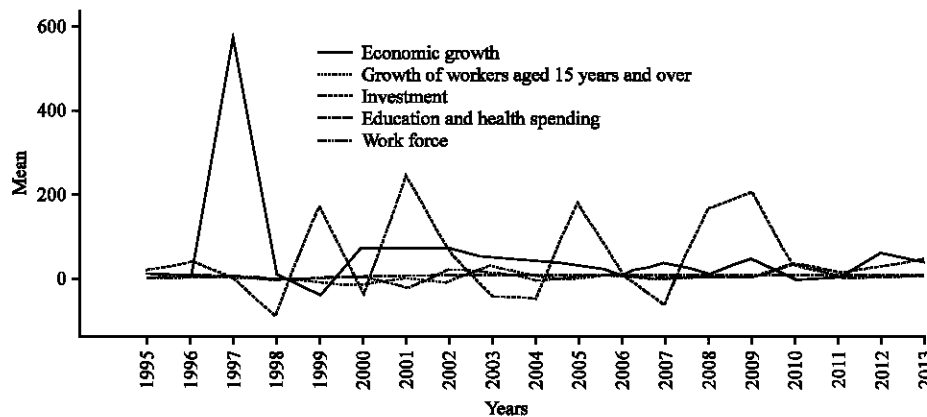
Fig. 2: Descriptive analysis 1995-2013 (%)

Judging from the number of labor force in Badung during 1995-2013 showed an average per year of 230,228.45 people with an average growth of 3.40% per year. Lowest growth in 2001 is equal to -22.16% and the highest in 2010 amounted to 31.26%. Movement up and down the growth of the labor force in Badung is strongly influenced by the success of Family Planning (FP) and the conditions of economic growth. During times of economic crisis, since, mid-1997, then followed up during the reform period of the administration of President Yudhoyono in 2010, family planning programs do not receive adequate attention from the government, this is caused by the high temperatures that resulted in the abandonment of the