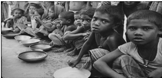
Fig. 2: Poverty alleviation programs and policies

and Rural Poverty Alleviation Programme, Rural employment project, Integrated Poverty Alleviation Programme, Rural Livelihood Project (Khan, 2007). Besides these government initiated programs, nongovernmental organizations are also actively involved in numerous programs and policies. These include Bangladesh Rural Advancement Committee's (BRAC) community empowerment programme, Grameen Bank's Housing for the poor (1984), BRAC's Income Generation for Vulnerable Group Development Program as A's Microfinance (credit and savings program, BRAC's Rural Development Programme (RDP), Grameen Bank's Microenterprise Loans and Grameen Bank's Loan Insurance, BRAC's groundbreaking ultra-poor programme (2002) as A's Hope for the Poorest, BRAC's.