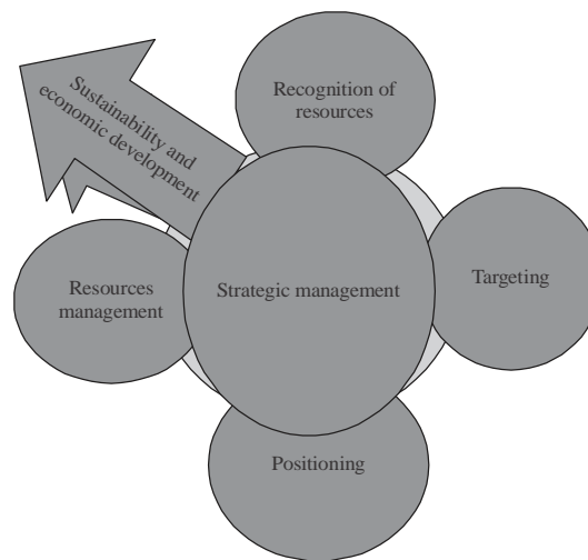
Fig. 1: Conceptual model of research

In general, development expresses the principles and rules that are specific to achieve certain goals that affect