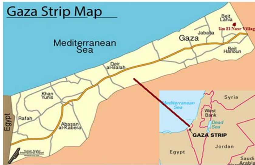
Fig. 2: General location of Umm Al-Nasr village