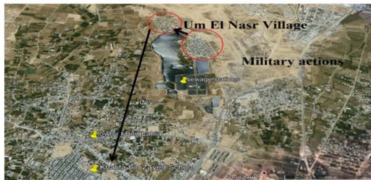
Fig. 5: Overall displacement operations to Khalifa Bin Zayed school