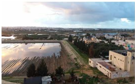
Fig. 3: Sewage basin