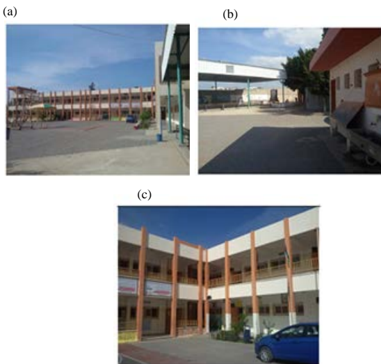
Fig. 6(a-c): Hamza bin Abi Talib school as a partial shelter for the displaced

Umm El-Nasr is exposed to the dangers of wars that cause overall displacement of the entire population because the village is in a location for military operations. There is also another danger that causes partial