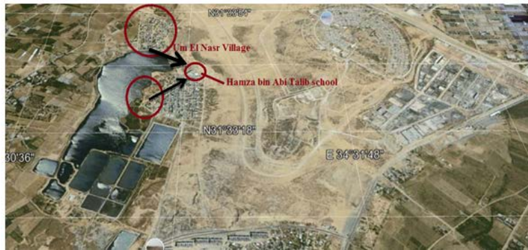
Fig. 4: Partial displacement to Hamza Bin Abi Talib school