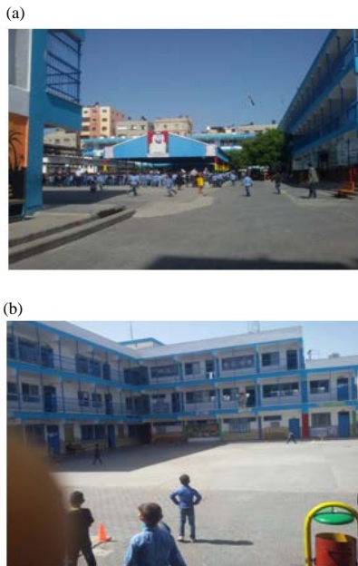
Fig. 7(a, b): Khalifa bin Zayed school temporary shelter in the event of war