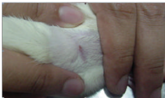
Fig. 2: Complete wound healing in 10% Vaseline treatment on day 12 after topical application

* p<0.05 significant from control (Group 1)