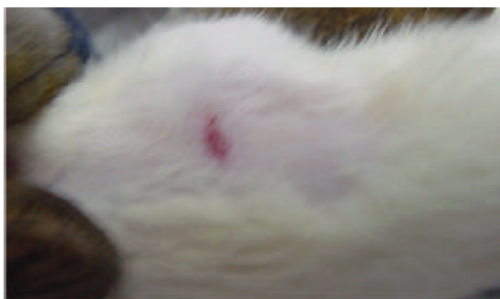
Fig. 3: Healing of wound treated with blank Vaseline on day 17 after topical application

The antioxidant properties of fermented papaya preparation are related to both hydroxyl scavenging as well as iron chelating properties. These antioxidant properties may be one of potential mechanism contributing to enhance wound healing [4] . Antioxidant activity of the Carica papaya decreases the risk of oxidative damage to tissues. Protection of cells against destruction by inflammatory mediators may be one of the ways in which the extracts from the plant, Carica papaya contribute to wound healing [8] . Osato et al. , [9] reported antibacterial and oxidant activities of unripe papaya and they correlate the bacteriostatic activity of papaya with its scavenging action on superoxide and hydroxyl radicals, which could be part of the cellular metabolism of such enteropathogens. This is indicative of the pathophysiological role of these reactive oxygen species in gastrointestinal diseases and papaya's ability to counteract the oxidative stress. In conclusion, aqueous extract of Carica papaya significantly accelerate wound healing compare to control and appeared to have several important properties that make it useful ideal as a dressing agent for wounds. Further studies are, however, required compare papaya to other accepted method of burn wound treatment and to define the précis role of papaya in burn wound management.