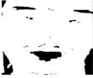
Fig. 3: Dilated representation of the Skin-tone representation

Face verification: Face verification is performed to ensure that the identified skin color region [9] is face but not hands or neck. For this we initially create a mask by creating a binary image of skin and non-skin region. This is a rectangle inside the main video frame rectangle. In this binary image, white pixels will represent skin-tone region in the video frame image. Non-skin regions, which include background, nails, hair, eyebrows and teeth, will be represented by black pixel. A sample video frame fragment and its skin-tone binary representation are given in Fig. 2.