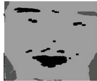
Fig. 4: Erosion applied over dilate representation of the skin-tone representation

The resultant values of the dilate operation are subjected to erode operation which is performed to magnify holes. After these operations are performed we get an image with large non-skin portions like eyes, eyebrows and mouth to be represented as holes, which will serve as mask. When there is no hole, then this signals the fact that this video frame does not hold any facial information. Figure 4 shows the erosion over dilation of the binary representation of the skin tone region.