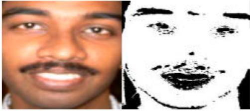
Fig. 2: Skin tone region and its binary representation