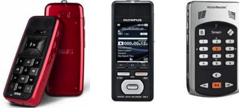
Fig. 2: DAISY player